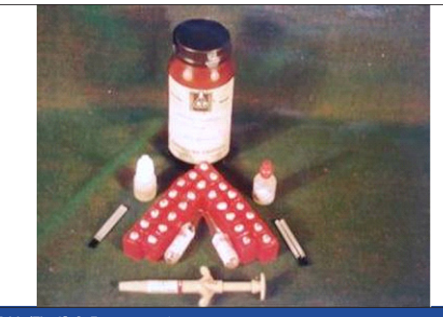
[Table/Fig-2]: SnF<sub>2</sub> group specimens