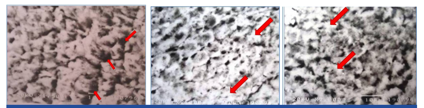
[Table/Fig-6]: Enamel after acid etch

SEM studies by Gwinett [12], Sheykholeslam [6] revealed no overt or gross alterations of the acid etched enamel surface after treatment