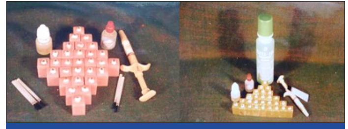
[Table/Fig-1]: Control group and APF gel specimens

Group II and V teeth were etched, rinsed and dried in the same way as the control group. Then 1.23% APF gel was applied for 4 min, rinsed, and dried before bracket placement. Group III and VI samples were etched. Then 8% stannous fluoride solution was prepared immediately before use to minimize the effects of hydrolysis and was applied continuously to the teeth with cotton applicator, so that the teeth are kept moist with the solution for four minutes and reapplication of the solution to a particular tooth is done every 15-30 sec, then rinsed and dried before bracket placement. Subsequently, brackets were positioned on six group teeth and allowed to bench cure at room temperature.